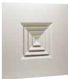
AN 704 TP

The AN 704 TP is a square ceiling diffuser for ceiling tiles with 4 air diffusion directions, for use in commercial buildings.