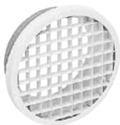
BEM 780 unit

The BEM 70 small terminal is used for return air in small commercial buildings and offers low pressure loss.