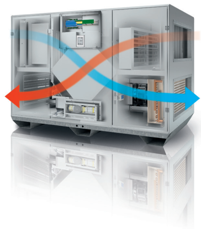
View of airflows in a VEX500