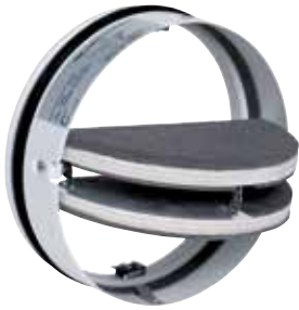
CF1/CF2 fire damper cartridge

The CF1/CF2 fire damper cartridge is part of the terminal fire damper range for commercial and industrial buildings.