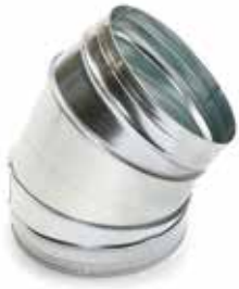
Sector 45° bend

The 45° bend is used to change the direction of a galvanised ducting system by a 45° angle.