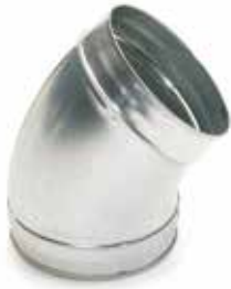
Pressed 45° bend

The 45° bend is used to change the direction of a galvanised ducting system by a 45° angle.