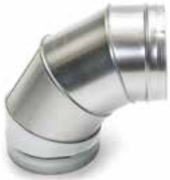
Sector 90° bend

The 90° bend is used to change the direction of a galvanised ducting system by a 90° angle.