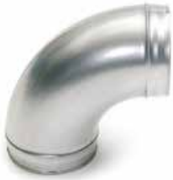
Pressed 90° bend

The 90° bend is used to change the direction of a galvanised ducting system by a 90° angle.