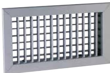
Grille AC 102D

The AC 102 D wall grille enables air supply on all ventilation and air-conditioning systems.