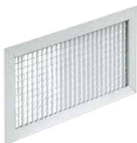
Grille AC 123

The AC 123 wall grille enables air extraction on all ventilation and air-conditioning systems.