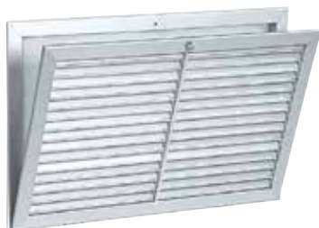
Grille AC 161

The AC 161 aluminium filtered hinged wall grille enables air extraction on all ventilation and air-conditioning systems.