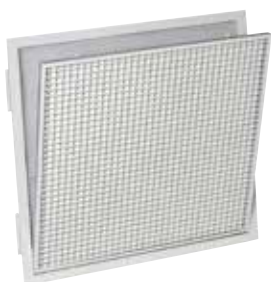
AC 174 WZ F1 400x200

The AC 174 aluminium filtered hinged ceiling grille enables air extraction on all ventilation and air-conditioning systems.