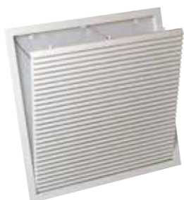
Grille AG 637

The AG 637 aluminium filtered hinged ceiling grille enables air extraction on all ventilation and air-conditioning systems.