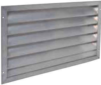
AG 639 F1 1000x1000

The AG 639 outdoor wall grille is used for fresh air intake or contaminated air outlet, with no risk of rain ingress due to the form of its vanes.