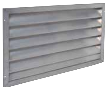
AG 639 F1 800x800

The AG 639 outdoor wall grille is used for fresh air intake or contaminated air outlet, with no risk of rain ingress due to the form of its vanes.