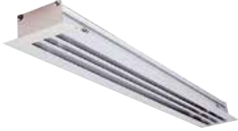
ALD613 1150 ALU + DAMPER

The ALD 610 - 620 is an aluminium linear fixed slot diffuser for use on air supply or return systems in non-residential buildings.