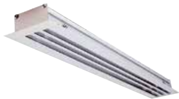
Diffuser ALD 610 - 620

The ALD 610 - 620 is an aluminium linear fixed slot diffuser for use on air supply or return systems in non-residential buildings.