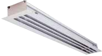
Diffuser ALD 610 - 620

The ALD 610 - 620 is an aluminium linear fixed slot diffuser for use on air supply or return systems in non-residential buildings.