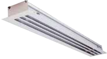
Diffuser ALD 610 - 620

The ALD 610 - 620 is an aluminium linear fixed slot diffuser for use on air supply or return systems in non-residential buildings.