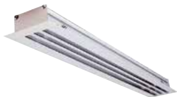
Diffuser ALD 610 - 620

The ALD 610 - 620 is an aluminium linear fixed slot diffuser for use on air supply or return systems in non-residential buildings.