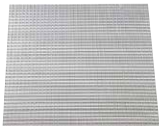
Grille AO 123

The AO 123 aluminium ceiling grille enables air extraction on all ventilation and air-conditioning systems.