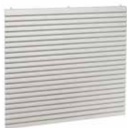
A0251 F0 AXB=600X600 ANOD

The AO 251 aluminium ceiling grille enables air extraction on all ventilation and air-conditioning systems.