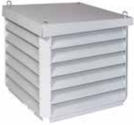
AP 639 H 600 EDIGULE TOITURE ALU

The AP 639 penthouse delivers fresh air intake or contaminated air outlet on ventilation and smoke / heat exhaust systems.