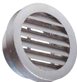
AR637 F0 D200

The AR 637 outdoor circular wall grille is used for air intake or contaminated air outlet, with no risk of rain ingress due to the form of its vanes.