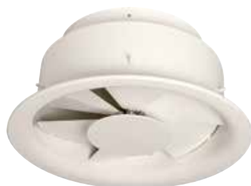
AR 883 diffuser

The AR 883 is a high-induction swirl jet diffuser for air diffusion in commercial buildings with high ceilings.