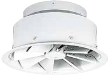
AR 883 D630 (c80)

The AR 883 is a high-induction swirl jet diffuser for air diffusion in commercial buildings with high ceilings.