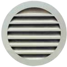
AR 637 grille

The AR 637 outdoor circular wall grille is used for air intake or contaminated air outlet, with no risk of rain ingress due to the form of its vanes.