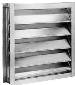
ATO75 500X500 DUCT DAMPER

The ATO 75 duct-mounted backdraft damper is used to create positive or negative pressure inside a room.