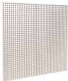
AU 124 grille

The AU 124 aluminium ceiling grille enables air extraction on all ventilation and air-conditioning systems.