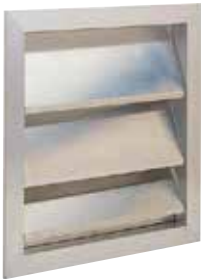
AVF75 800X400 DAMPER/NEG

The AVF 75 wall-mounted backdraft damper is used to create negative pressure inside a room.