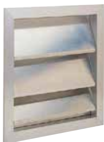
AVF75 800X500 DAMPER/NEG

The AVF 75 wall-mounted backdraft damper is used to create negative pressure inside a room.