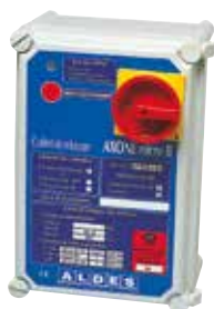
AXONE 1V/DES-Tri 16.7+IPDP T1

AXONE Micro III 1SP/DES is a pre-wired, NF-certified safety box used to control smoke and heat exhaust fans.