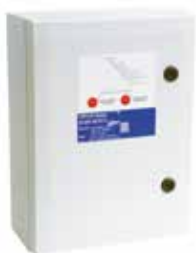
AXONE 1V/DES-Tri 43.3A T1

AXONE Micro III 1SP/DES is a pre-wired, NF-certified safety box used to control smoke and heat exhaust fans.