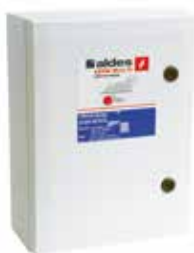
AXONE box Progressive start 1 Speed (25.4 A, 43.3 A) Size 1

AXONE Micro III 1SP/DES D.PROG is a pre-wired, NF-certified safety box used to control smoke and heat exhaust fans.