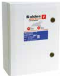
Closed AXONE box, with switch and 2 pressure switches