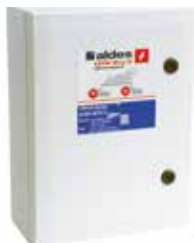
Closed AXONE box, with switch and 2 pressure switches