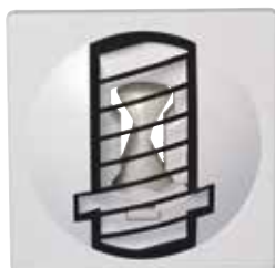
BAP COLOR GREY

The BAP COLOR Standard Dual-Airflow terminal is ideal for refurbishment projects - it offers two airflow settings: a base airflow whatever the conditions inside the dwelling and a boost airflow activated by pulling the cord.