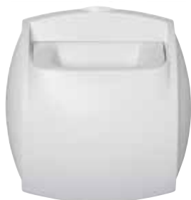
BAP'SI fixed airflow bath/WC terminal

The BAP'SI Fixed bath/WC terminal is ideal for new construction projects - it ensures a constant airflow whatever the conditions inside the dwelling.