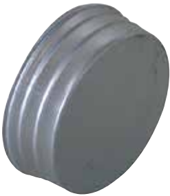
Bouchon Mâle Femelle en aluminium

The BMF aluminium male-female plug seals off an aluminium duct or accessory in commercial and multi-occupancy residential buildings.