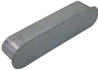
Oblong Male Plug

The Oblong Male Plug seals off an oblong duct system in commercial and multi-occupancy residential buildings.