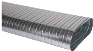
Oblong Rigid Spiral Ducts

The galvanised oblong duct is a high-performance alternative to rectangular ducting, enabling high airflows in limited spaces.