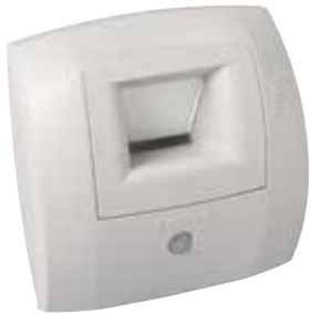
Bahia Curve bath Detection

The BAHIA CURVE humidity-controlled terminal for bathrooms and WC ensures sufficient and constant extraction of indoor pollution according to the humidity level in the room.