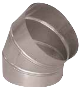
45° bend aluminium

The aluminium 45° bend is used to change the direction of an aluminium ducting system by a 45° angle.