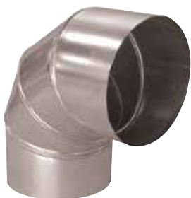
90° bend aluminium

The aluminium 90° bend is used to change the direction of an aluminium ducting system by a 90° angle.