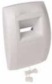
Image of Bahia Curve L C21 terminal

The BAHIA CURVE L humidity-controlled terminal for kitchens ensures sufficient and constant extraction of indoor pollution according to the humidity level in the room.