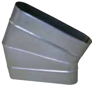
30° bend oblong horizontal

The oblong horizontal 30° bend is used to change the direction of an oblong ducting system by a 30° angle in the plane of the system.