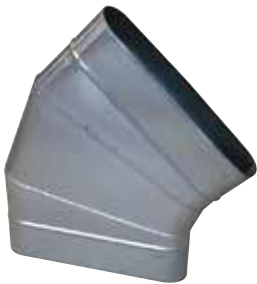
45° bend oblong horizontal

The oblong horizontal 45° bend is used to change the direction of an oblong ducting system by a 45° angle in the plane of the system.