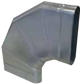
90° bend oblong horizontal

The oblong horizontal 90° bend is used to change the direction of an oblong ducting system by a 90° angle in the plane of the system.