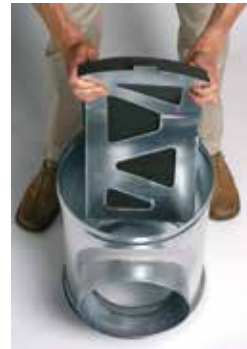
Installation du déflecteur acoustique et aéraulique dans le caisson piquage