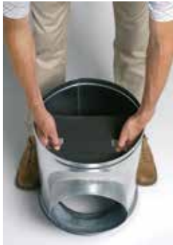
Installation du détecteur acoustique et aéraulique dans le caisson piquage